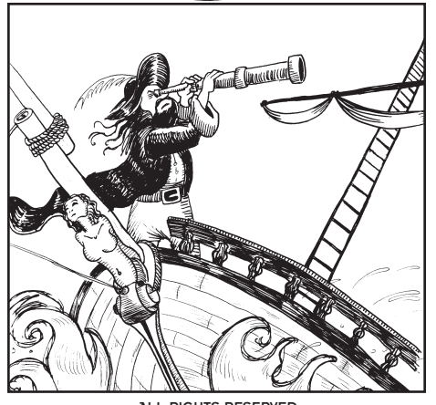
ALL RIGHTS RESERVED