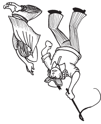
tooting with him - a Captain of my own Vessel! the Captain and to rise amongst his ranks, until I stood on equal I resolved then and there, as I began swabbing furiously, to please

"...mnd tennga dgad besar rased daya birrod seoda, auso B sdT"